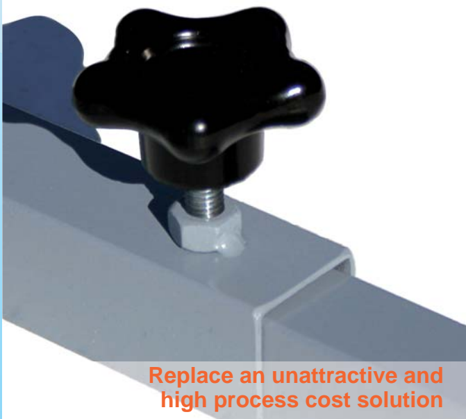
Replace an unattractive and high process cost solution